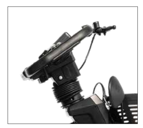
Rear Bumper Digital Display Supplemental Hand Brake